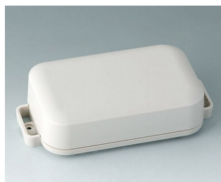
C3207207 EASYTEC 125 ASA+PC (UL 94 V-0) off-white RAL 9002 5.79"x3.07"x1.46" IP 65 opt., IP 40