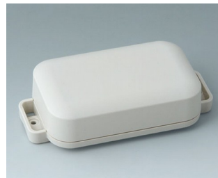
C3206207 EASYTEC 100 ASA+PC (UL 94 V-0) off-white RAL 9002 4.76"x2.44"x1.22" IP 65 opt., IP 40