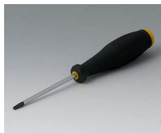
A0399T08 Torx T8 screwdriver