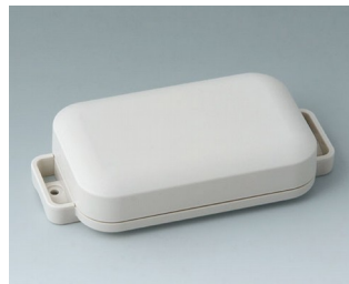
C3206107 EASYTEC 100 ASA+PC (UL 94 V-0) off-white RAL 9002 4.76"x2.44"x1.02" IP 65 opt., IP 40