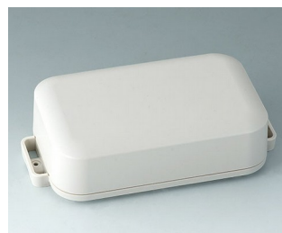
C3208207 EASYTEC 150 ASA+PC (UL 94 V-0) off-white RAL 9002 6.77"x3.66"x1.81" IP 65 opt., IP 40