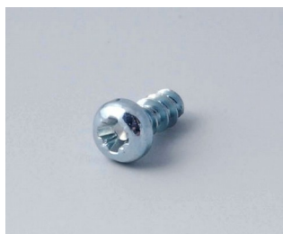
A0305031 Self-tapping screws 0.098" x 0.236" (PZ1)