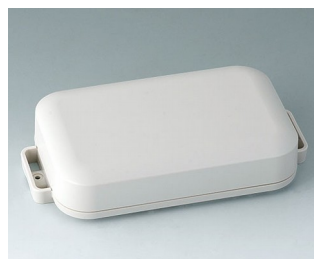
C3208107 EASYTEC 150 ASA+PC (UL 94 V-0) off-white RAL 9002 6.77"x3.66"x1.42" IP 65 opt., IP 40