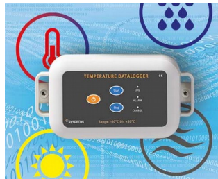
Data logger e.g. for temperature