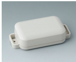
C3204207 EASYTEC 80 ASA+PC (UL 94 V-0) off-white RAL 9002 3.98"x1.97"x1.02" IP 65 opt., IP 40