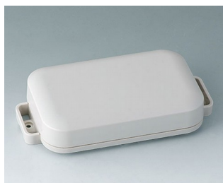
C3207107 EASYTEC 125 ASA+PC (UL 94 V-0) off-white RAL 9002 5.79"x3.07"x1.18" IP 65 opt., IP 40