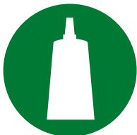
Installation / Assembly of accessories