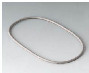
A9502030 Sealing 100