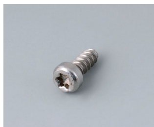
A0325060 Self-tapping screw 0.098" x 0.236" (T8) Stainless steel