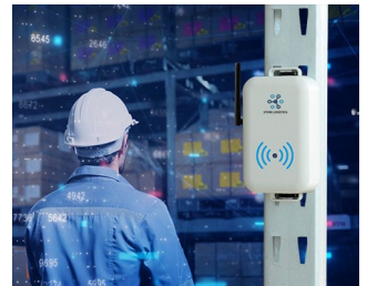
Smart store logistics