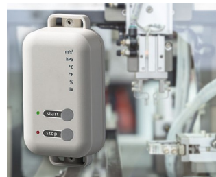
Data logger with gateway function