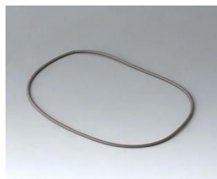
A9503030 Sealing 125