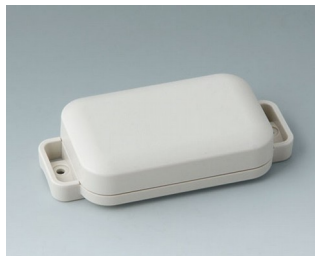
C3204107 EASYTEC 80 ASA+PC (UL 94 V-0) off-white RAL 9002 3.98"x1.97"x0.87" IP 65 opt., IP 40