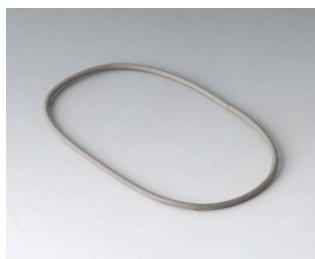
A9500030 Sealing 80