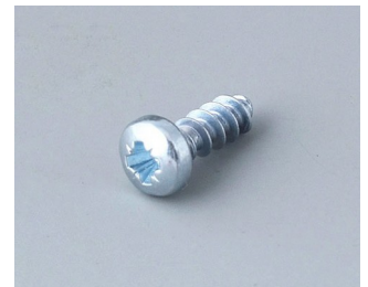
A0308031 Self-tapping screws 0.118" x 0.315" (PZ1)