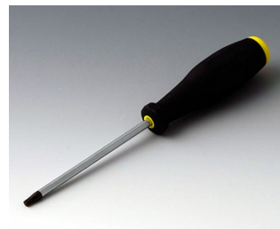
A0399T20 Torx T20 screwdriver