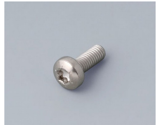
A0330080 Screw M3 x 3.150" (T10) Stainless steel