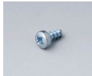
A0306031 Self-tapping screws 0.118" x 0.236" (PZ1)