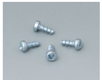
A9199008 Set of screws