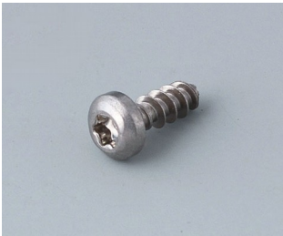
A0308132 Self-tapping screw 0.118" x 0.315" (T10) Stainless steel