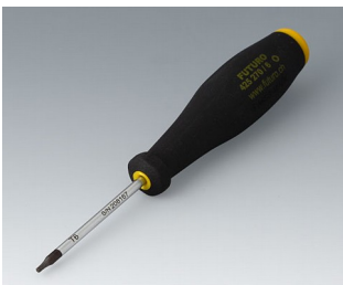
A0399T06 Torx T6 screwdriver