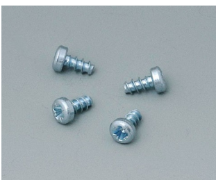
B5111201 Set of screws