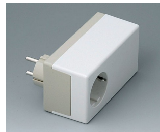
A9022465 PLUG CASE D, Vers. II PC+ABS (UL 94 V-0) pebble gray RAL 7032 4.72"x2.56"x2.17"