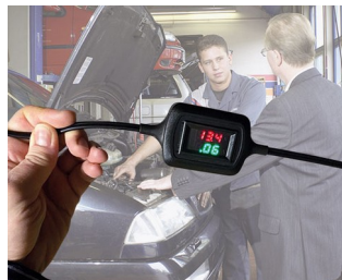
Voltage and current display during trickle charging