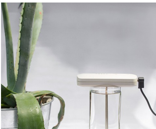
Tool for making colloidal silver solutions