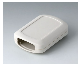
B2832107 CONNECT M ASA+PC (UL 94 V-0) off-white RAL 9002 2.99"x2.13"x0.87"