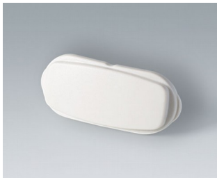
B2811207 End part ASA+PC (UL 94 V-0) off-white RAL 9002