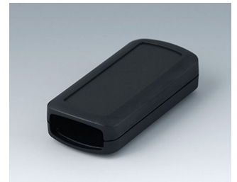
B2823109 CONNECT S ASA+PC (UL 94 V-0) black RAL 9005 3.54"x1.65"x0.87"