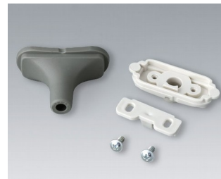
B2911328 Cable gland kit, 0.197" - 0.232" TPE volcano