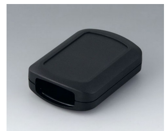
B2832109 CONNECT M ASA+PC (UL 94 V-0) black RAL 9005 2.99"x2.13"x0.87"