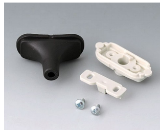
B2911319 Cable gland kit, 0.165" - 0.197" TPE black RAL 9005