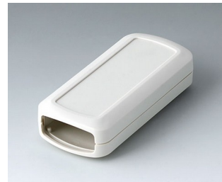
B2823107 CONNECT S ASA+PC (UL 94 V-0) off-white RAL 9002 3.54"x1.65"x0.87"