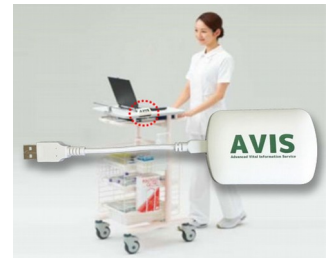
Receiver and data transfer for EMR