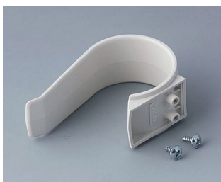
A9167027 Holding clamp PA 6 (UL 94 HB) off-white RAL 9002