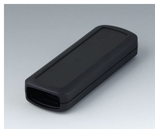
B2824109 CONNECT S ASA+PC (UL 94 V-0) black RAL 9005 4.72"x1.65"x0.87"