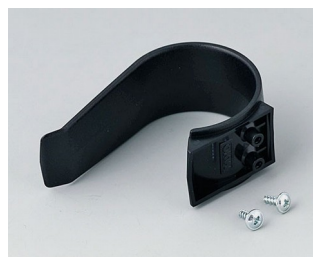
A9167029 Holding clamp PA 6 (UL 94 HB) black RAL 9005