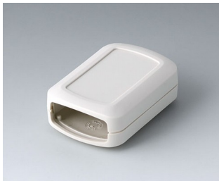
B2822107 CONNECT S ASA+PC (UL 94 V-0) off-white RAL 9002 2.36"x1.65"x0.87"