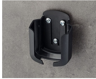
B2931509 Holder M ASA+PC (UL 94 V-0) black RAL 9005