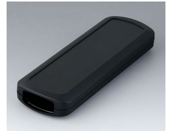
B2834109 CONNECT M ASA+PC (UL 94 V-0) black RAL 9005 6.14"x2.13"x0.87"