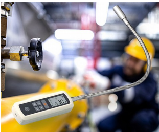
Gas leak detector