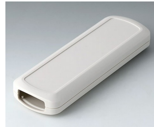
B2834107 CONNECT M ASA+PC (UL 94 V-0) off-white RAL 9002 6.14"x2.13"x0.87"