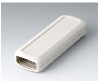
B2824107 CONNECT S ASA+PC (UL 94 V-0) off-white RAL 9002 4.72"x1.65"x0.87"