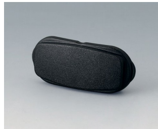
B2811209 End part ASA+PC (UL 94 V-0) black RAL 9005