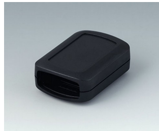
B2822109 CONNECT S ASA+PC (UL 94 V-0) black RAL 9005 2.36"x1.65"x0.87"