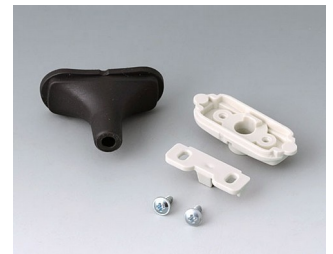
B2911329 Cable gland kit, 0.197" - 0.232" TPE black RAL 9005