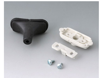
B2911309 Cable gland kit, 0.134" - 0.165" TPE black RAL 9005