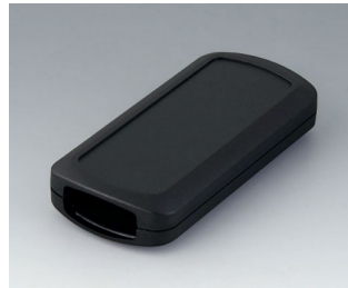
B2833109 CONNECT M ASA+PC (UL 94 V-0) black RAL 9005 4.57"x2.13"x0.87"